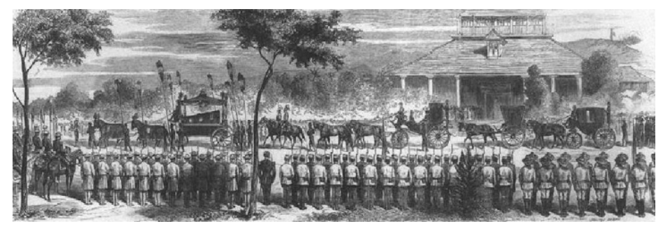
Funeral procession for King Kamehameha the Third

broad collar trimmed with white, and with the American Marines of the St. Marys in their neat uniform of white and blue, trimmed in red. ..."